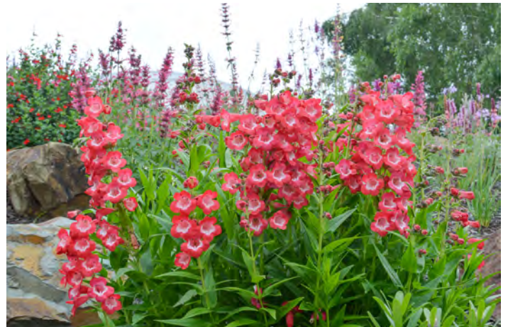
Penstemon 'Bell Tower Red'

Penstemons are worthy of a space of their own in the garden border to show off their dense habit and prolific displays of flower stems. However, they can be 'crowded' in amongst other warm weather flowering perennials such as Stokesia, Coreopsis & Agastaches for natural looking tapestry of colour. Ideal for mass planting where, rubbing elbows, they will astonish with the solid block of colour when in flower!