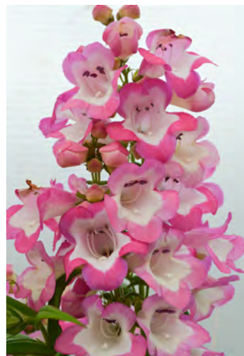
Penstemon 'Bell Tower Pink'