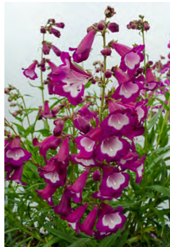
Penstemon 'Bell Tower Purple'