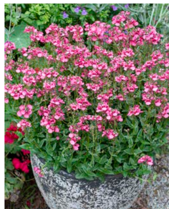
D. 'Gardascia Candy Pink'