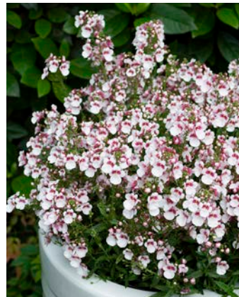
D. 'Gardascia Appleblossom'