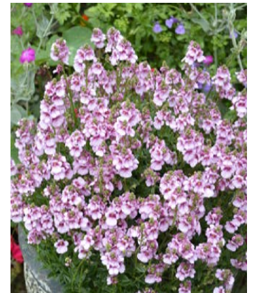
D. 'Gardascia Strawberry'