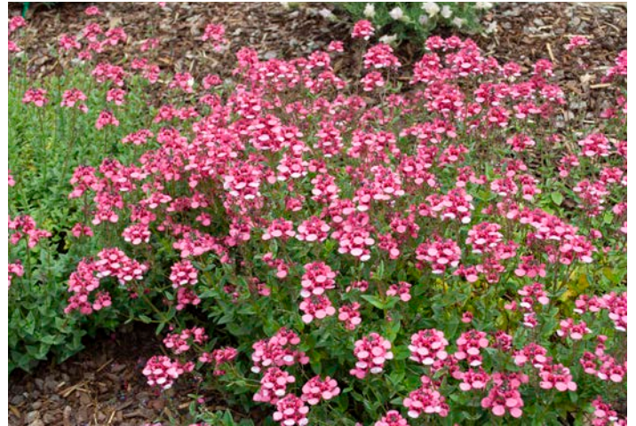
A range bred specifically for hardy and reliable performance in garden beds and borders.

Apply a slow release fertiliser during early spring and early autumn to improve overall vigour. Mulch well to help retain moisture during dry periods.