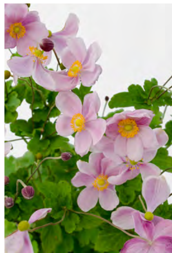
A. 'Marchenfee' Height: 60cm Spread: 60cm