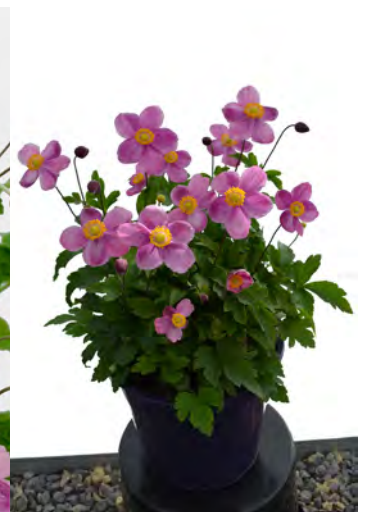
A. 'Little Princess' Height: 45cm Spread: 60cm