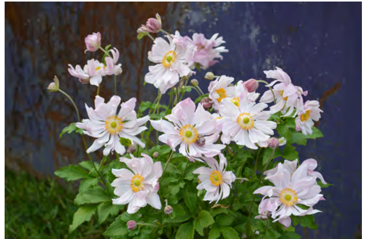
A. 'Queen Charlotte' Height: 80cm x Spread: 80cm

Commonly known as windflowers , members of the Anemone family have been long cherished for their graceful, airy floral displays - particularly as they can flower in the shady, difficult sites. Easy to grow and hardy once established they require little attention. During extended periods of heat, foliage may recede but will re-appear with a fresh appearance as autumn approaches. Smaller varieties are suitable for container culture. Best effects in the garden are achieved when planted en masse. Ideal companions include Brunnera 'Jack Frost', Lamiums and Hellebores.