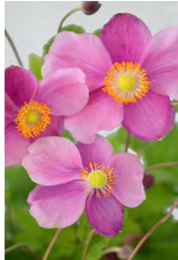
A. 'Bowles Purple' Height: 30cm Spread: 60cm